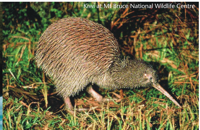
Kiwi at Mt Bruce National Wildlife Centre