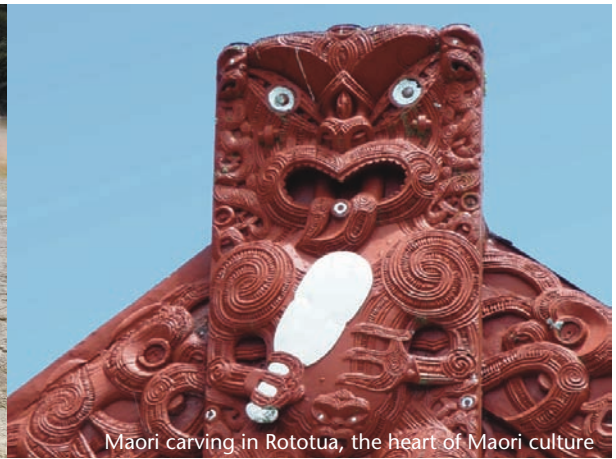
Maori carving in Rotorua, the heart of Maori culture