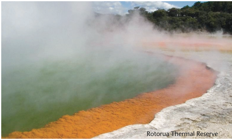
Rotorua Thermal Reserve