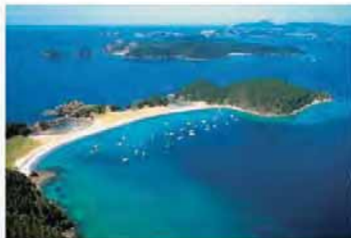
In a 2006 study, the Bay of Islands was found to have the second bluest sky in the world, after Rio de Janeiro. Dumé, Belle (2 August 2006)